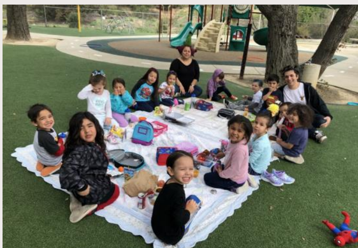
Pre-K children enjoying an activity outside

In celebrating Dr. Seuss birthday, March 4 th through the 7 th was spirit week for the San Pasqual Pre-K classroom. The children loved it as they were able to participate in crazy hair day, hat day, sports day, and wacky Wednesday.