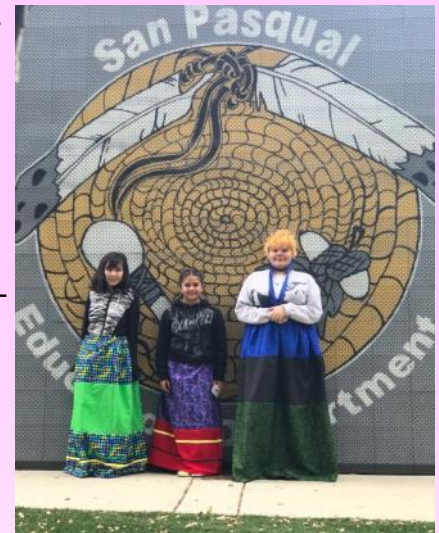
Participants show their creations

For Spring Break the San Pasqual Education Center provided material, sewing machines and irons for a traditional Bird Skirt sewing project for the San Pasqual Native youth. Students met at the San Pasqual Education Center on April 15-16, 2019 to make their very own Bird Skirt. The girls were given the opportunity to pick out their choice of fabric, measure and cut fabric to needed lengths, and sew the fabric together with sewing machines. Everyone worked together and created their own unique skirts. Most of the ladies who attended this event were first time bird skirt makers. It was a great time and the energy in the room was gratifying. This project was in collaboration with the Native Women's Resource Center and the San Pasqual Housing & Community Development who provided the funds for purchasing the materials. This was an opportunity to introduce domestic violence and teen dating violence awareness to the young girls that participated. There were approximately twenty (20) participants. For more information on educational services please call Lorraine Orosco, Director or Deana Martinez, Program Manager: (760) 751-1474.