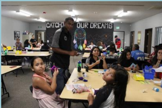
Students participating in their YIM groups