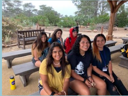
Students on the summer beach trip during Summer Nights