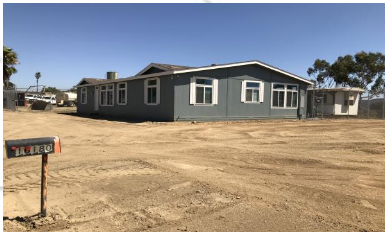
New Public Works and Planning building nearing completion

The San Pasqual Public Works and Planning departments have a new home on the south-east corner of Kumeyaay Way and Kumeyaay Path. The new facility will provide expanded and upgraded office and meeting space for the departments. The street address for the new building is 16180 Kumeyaay Way.