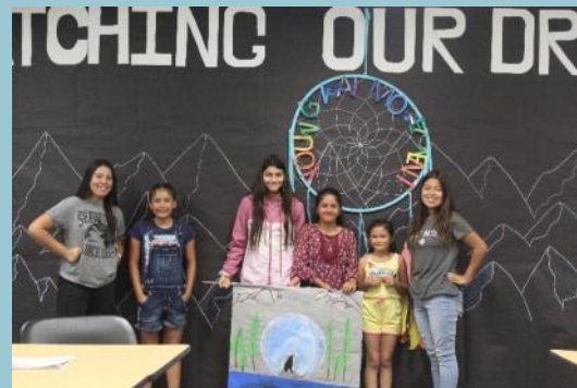
Students presenting their clan during YIM