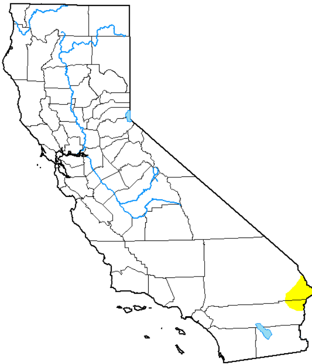
Drought Conditions (Percent Area)